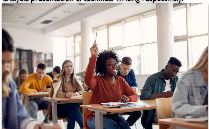
The Exec .ELA & Maths curriculum focus on data analysis/presentation & technical writing respectively.

Being able to collect, present & analyse data are critical skills for every executive to learn. English language arts (ELA) & Mathematics is core to any STEAM career field, we provide BPS teacher supported executive ELA & math Prep to prepare our youth for STEAM management positions.